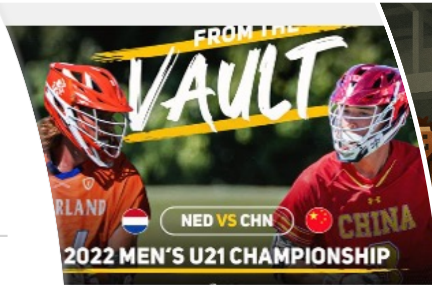
...t: Netherlands and China battle at the 2022 Wor ...s U21 Championship

We pride ourselves on building In Country first. Our priority is growing the game in the Netherlands, and fielding our national teams primarily locally. Our national programs practice together year-round. While other countries have opted to just bring as many American dual-passport holders as possible, we don't do that. As such, we have earned the respect of the international community.