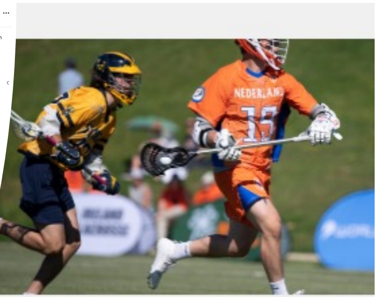
...n's U20 European Championship underway in Wroclav